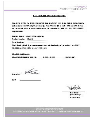
CERTIFICATE OF LIGHT OUTPUT